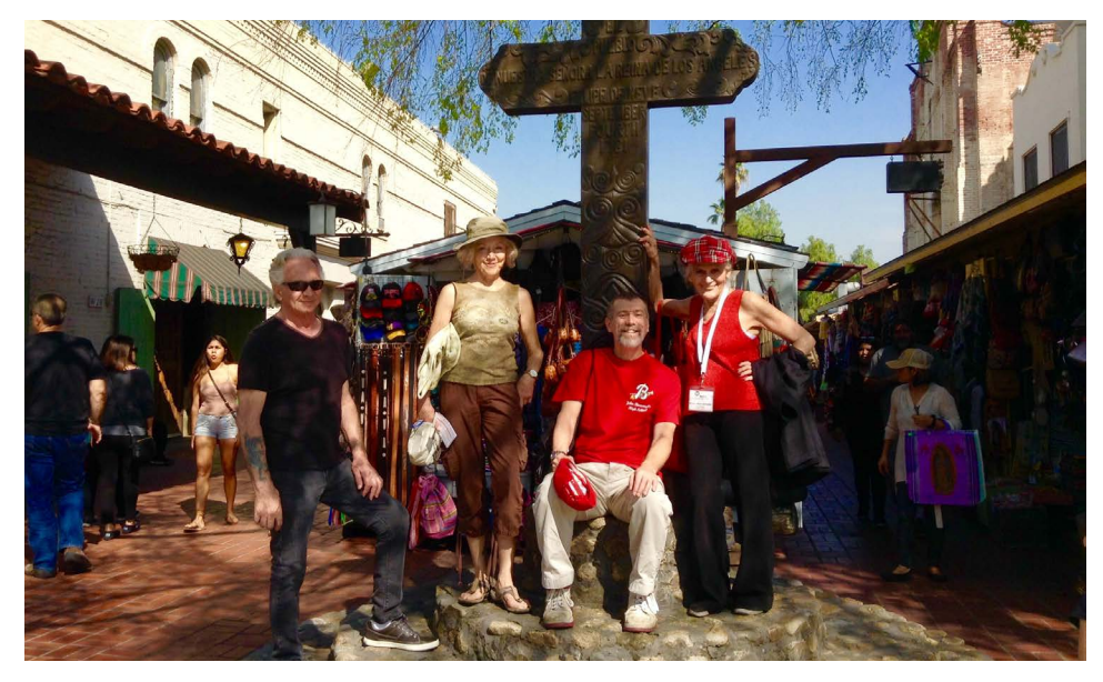
The Go Metro group recently explored Olvera Street, Union Station and Chinatown. Join them this month! See page 5.