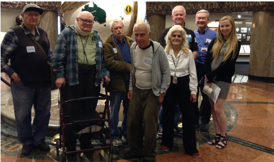
The Go Metro group toured the L.A. Times and City Hall in May.