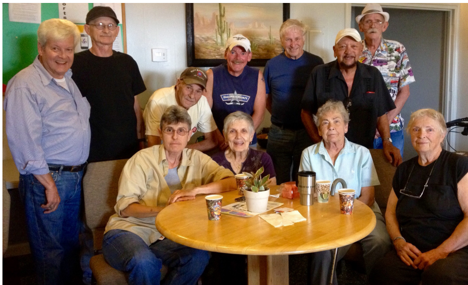
The Valley Group celebrated PRIDE with a special potluck in June.