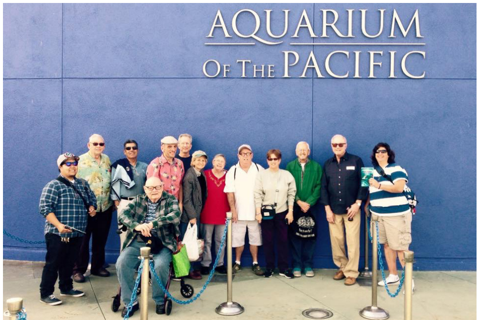
We went to the Aquarium of the Pacific on Fri, Jan 16.