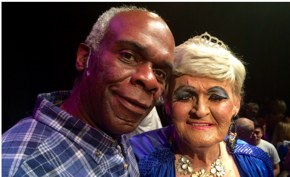
Two stars of NEWSTAGES' Life in the First Gay City pose after the June 28th performance in the Renberg. Miss the show? Watch it at facebook.com/50pluslgbt for free!